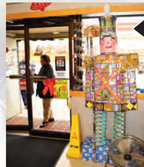
A giant toy soldier made of Scratch tickets greets customers as they enter Tag's One Stop in Nebraska City.