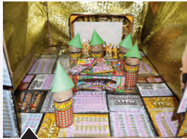
It's all in the details for the employees of Casey's in Springfield, who created this scene of elves opening presents around a warm fire.

Does your store have a holiday decoration featuring Nebraska Lottery tickets? Send photos to lottery@nelottery.com . We'll upload them to a Flickr album and share on our Facebook page for all to see!