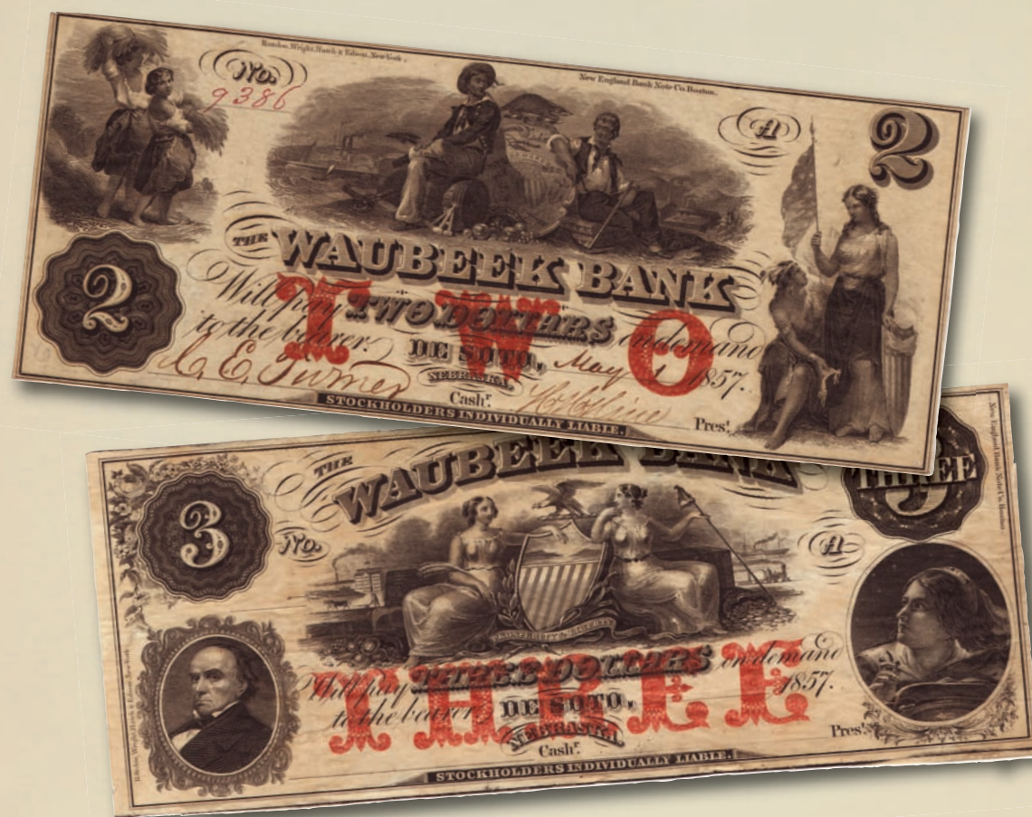
A two and three dollar bill from the Waubeek Bank of De Soto, Nebraska dated May 1, 1857.