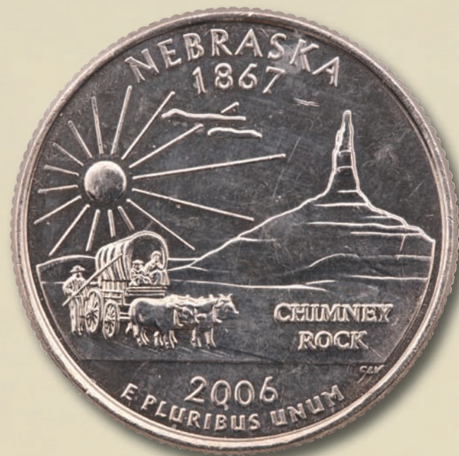
The 37th quarter released in the 50 State Commemorative collection.