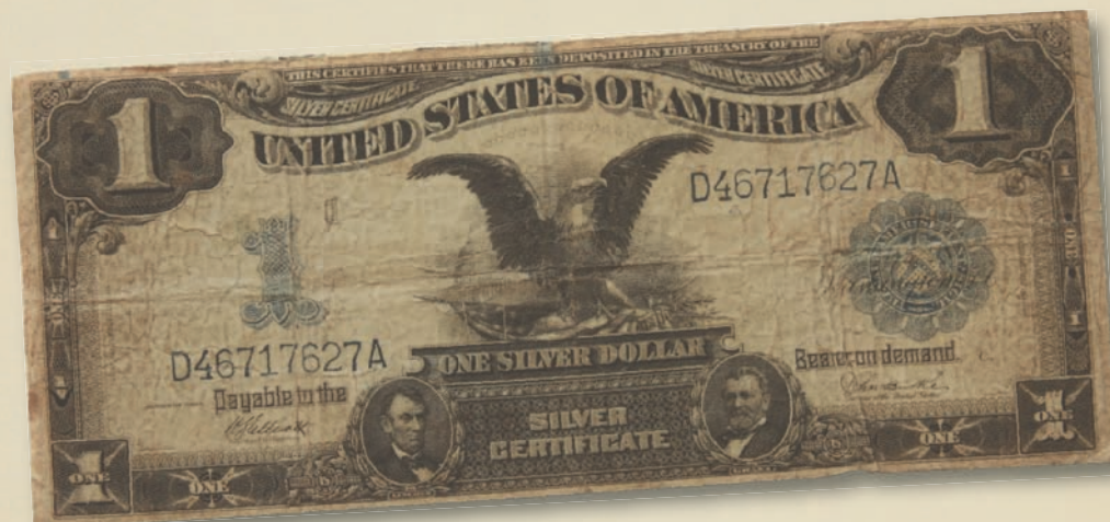
A one dollar silver certificate bill.