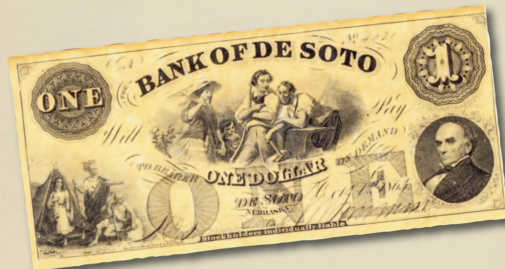
A one dollar bill from the Bank of De Soto, Nebraska.