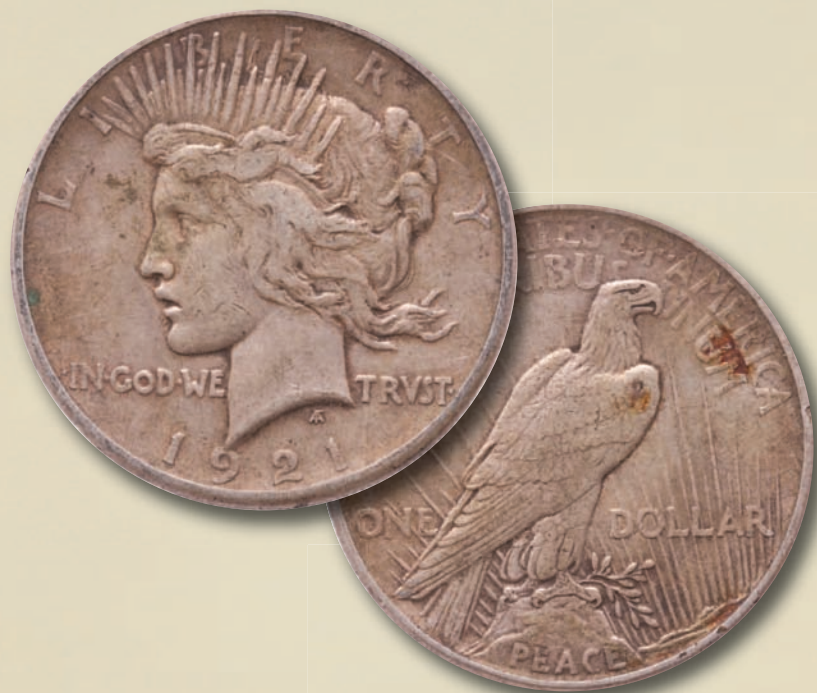
A 1921 Peace Silver Dollar.